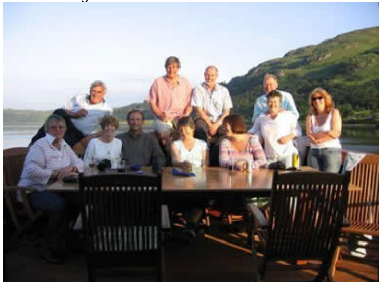
Enjoying a drink and the scenery from the aft deck