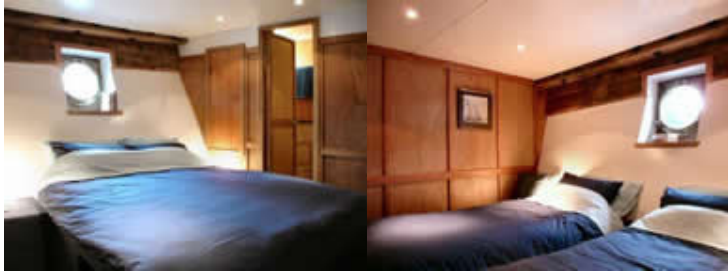
Twin and double ensuite cabins are available aboard The Glen Massan