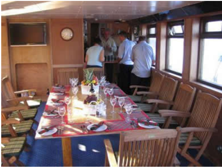
Dining aboard in our comfortable deck saloon